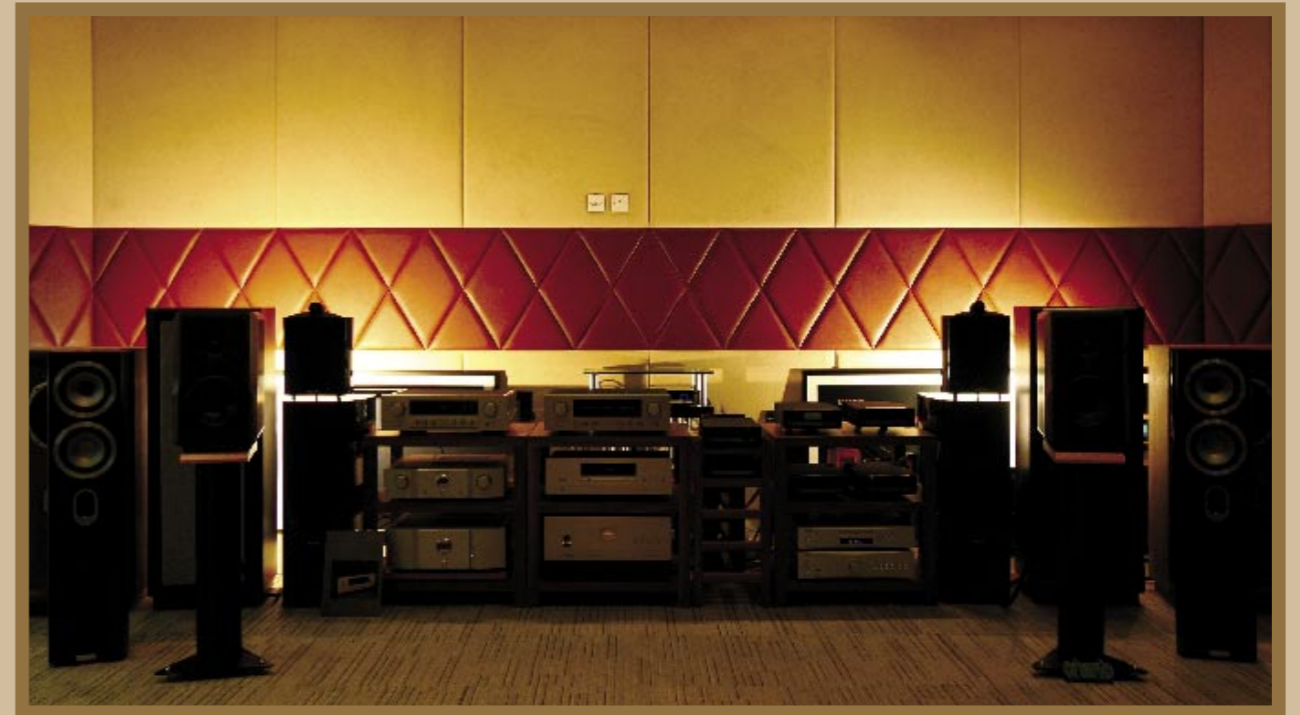
Visitors to the store can try out equipment in the sound proofed acoustic studio. 內的隔音試聽室提供優質音響設備，供顧客試聽。

A great composition can swing our emotions and bring joy and peace to the heart