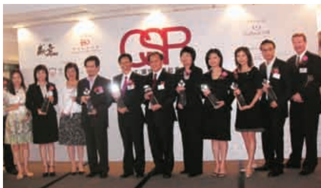
Prime Awards for CSR 2007

The “Prime Awards for CSR 2007” presented to the Group in October 2007 highlights its efforts in fulfilling its corporate duties, in particular in the areas of corporate social responsibility initiatives, community donations, responding to societal needs, being staff and staff family friendly, encouragement of volunteering, partnerships with enterprises who share common values, and sharing of knowledge and expertise with the community.