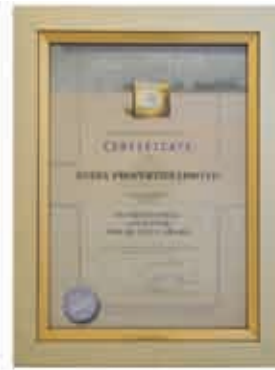
2007 ARC Awards – Annual Report Competition

The Group is proud to report that in June 2007, "MegaBox" received the prestigious "2007 Digie Awards" (Commercial Real Estate Digital Innovation Awards) from world-leading real estate conference and exposition organiser Realcomm. "MegaBox" was named the winner in the "Extreme Retail Complex" category which recognises the forward-thinking leaders in commercial real estate who are making the greatest impact through the use of technology and automation. "MegaBox" was singled out as having demonstrated the most advanced and sophisticated marketing centre presentation and advanced use of building automation systems, as well as the greatest use of advanced retail building and technology concepts.