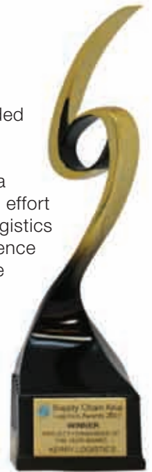
Supply Chain Asia Logistics Awards 2007

In November 2007, KLN was awarded the “Project Forwarder of the Year” in the “Supply Chain Asia Logistics Awards 2007” by Supply Chain Asia Magazine. The award is an industry effort in recognising the contribution of logistics companies and supply chain excellence in Asia. KLN was one of the top five finalists in five categories covering different aspects of the logistics industry, including Asian 3PL, Global 3PL, Airfreight Forwarder, Seafreight Forwarder and Project Forwarder. The judging process begins with online nomination by readers and members prior to final judging.