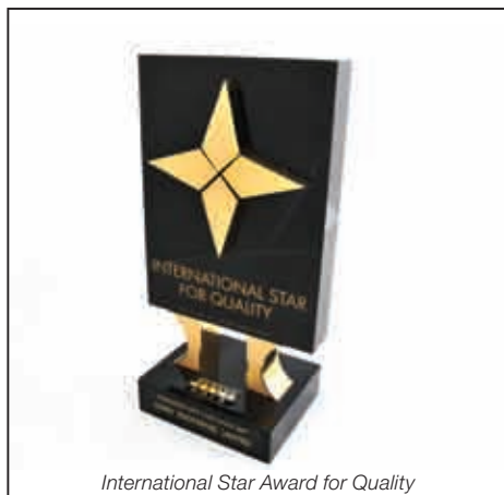
International Star Award for Quality