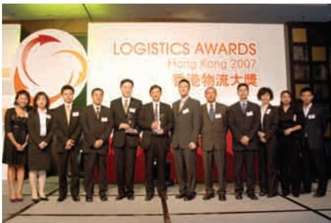
Logistics Awards Hong Kong 2007

KLN’s excellence and success in the logistics industry was further recognised when it was conferred with the “Outstanding Achievement Award” and the “Service & Technology Innovation Award” in the “Logistics Awards Hong Kong 2007” in September 2007. This award is an initiative led by Hong Kong Trade Development Council (“HKTDC”) with the support of the Hong Kong logistics industry, with the aim of commending the strong leadership skills of local logistics companies. This marked the second time that KLN has received double logistics awards from HKTDC since the first logistics award held in 2005. In particular, the “Outstanding Achievement Award” recognises contributions to the logistics industry and to society, and the “Service & Technology Innovation Award” rewards unique and creative applications of innovation and technology, and enhancement of internal and market performance.