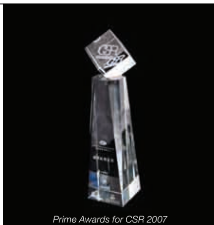
Prime Awards for CSR 2007