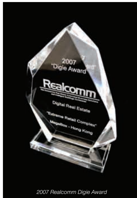
2007 Realcomm Digie Award

The "International Star Award for Quality – Gold Category" was conferred on the Group at the 21st World Quality Commitment Convention held in Paris in October 2007. These annual awards are presented by Business Initiative Directions based on the principles of total quality management in customer satisfaction, communication strategies, leadership, planning and decision-making, human resources and training, and business results.