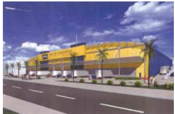
Model of logistics centre at Yantian, Shenzhen, PRC

In order to establish the division's network in southern China, a joint venture agreement was signed with the Yantian Port Group in Shenzhen in March 2001 to develop a 40,000 square metres logistics centre in the Yantian Free Trade Zone next to Terminal 2 of the Yantian Port. This facility is well situated at a convenient location and will be able to serve the entire Pearl River Delta. In view of the current limited supply of bonded storage facilities in the Free Trade Zone, the market potential for logistic services in this area is highly promising. Conceptual design of the logistics centre has been finalized and tenders from