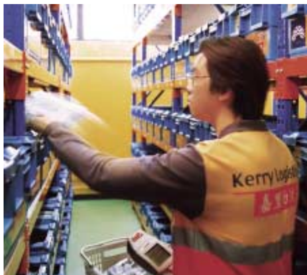
Small parts handling service

Development efforts in other major cities in the Asian Pacific region will intensify in 2002 with plans to extend the network to Singapore, Philippines, Malaysia and Taiwan in due course. The division is also looking for strategic alliances outside Asia which have a strong presence in terms of network that can enable us to have immediate access to multinational customers. The aim is to deliver a higher level of expertise in integrated logistics management as well as offer a wider logistics service package to customers whilst continuing to establish a network of operating points in the region.