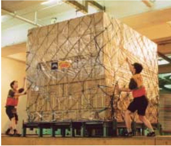
Air cargo palletization

In Hong Kong, the division has more than 400,000 square feet of warehouse space dedicated to the logistics division. The division is also operating a fleet of 90 vehicles which is capable of providing premier distribution services. Capitalizing on its strengths and leading position in warehousing in Hong Kong, the division's logistics business has taken off rapidly from having less than 5 customers in 1999 to over 70 customers at the present time with clients in multiple market segments, including industrial products, telecommunications, branded consumer goods, fast food shops and convenient stores. The division will continue to enhance its competencies and develop its competitive advantages in order to command and secure a leading position in the logistics business in Hong Kong within the next few years.