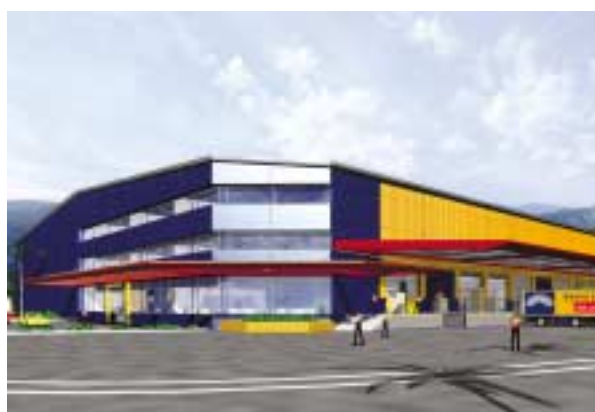
Model of logistics centre at Laem Chabang Port, Thailand

and local transport services, loading/unloading and storage services at rail terminals. It has over 30 years of experience as a road and rail operator. The acquisition enables the division to explore potential business synergies and to add the Australasian presence to our logistics network.