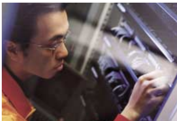
Leading edge technology

Given the current low penetration rate for third party logistics ("3PL") providers in the PRC, together with the vast market to be opened up as a result of the PRC's entry into the WTO, the potential growth of 3PLs in China is expected to be significant. The division believes that it has got distinctive advantages in the PRC market with its early penetration and existing establishments which allows it to position itself effectively in securing potential customers. The division aims at establishing its position as a niche total solution provider in the PRC market within the next decade by building a competitive nation-wide network of logistics operations in the PRC.