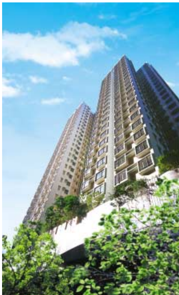
Jupiter Terrace, North Point

Ava Mansion, another of the Group's luxury developments, is located at the prestigious address of 3 Tregunter Path, Mid-Levels, adjacent to another of the Group's luxury residential buildings, Branksome. The Group has made use of the unutilised