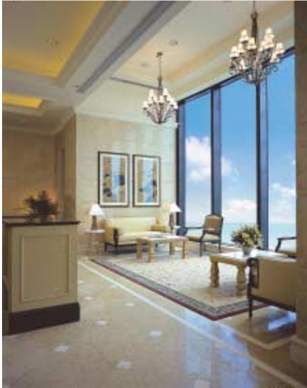
Clubhouse lobby of Ocean Pointe at Sham Tseng

of carpark and has a typical floor plate of approximately 10,000 square feet and a total gross floor area of approximately 250,000 square feet. Approximately 70% of the development had been sold as at 31 December 2001.