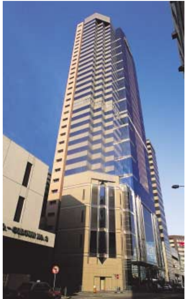
Enterprise Square 2, Kowloon Bay

The Group has continued with the disposal of units in non-wholly owned properties like Enterprise Square and Tregunter Towers during the year under review. In 2001, approximately 19,872 square feet of Enterprise Square and 12 units in Tregunter Towers were sold. The remaining penthouse unit in Tavistock II was also sold in April 2001.