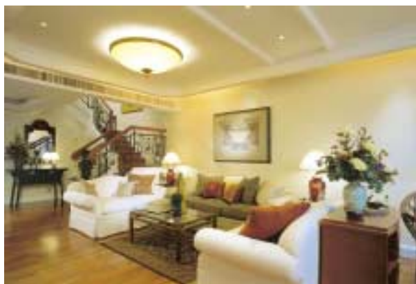
Living room of duplex apartment at Constellation Cove, Tai Po

Sales of the Group's joint venture developments are also progressing with approximately 89% and 75% in Phases 1 and 2 of the Tai Kok Tsui project being sold, respectively, as at 31 December 2001.