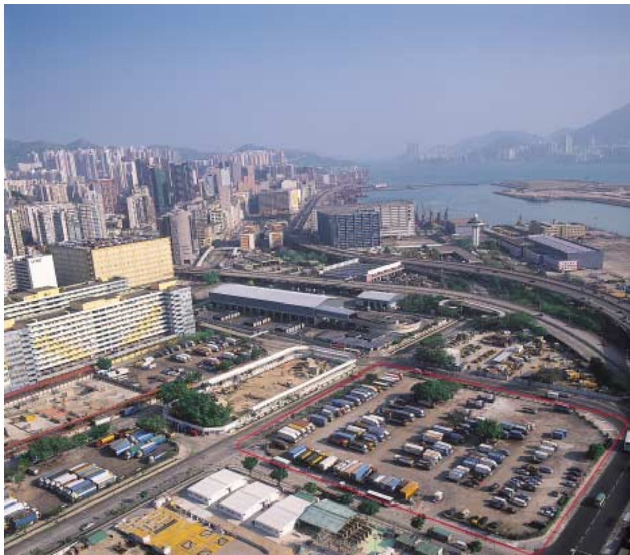
The sites of Enterprise Square 3 (white hoarding) and Enterprise Square 4 in the foreground outlined in red in Kowloon Bay

when completed, will provide 68 apartments inclusive of 2 duplex penthouses with unit sizes ranging from 2,230 square feet to 5,400 square feet. Each penthouse will have an exclusive swimming pool.