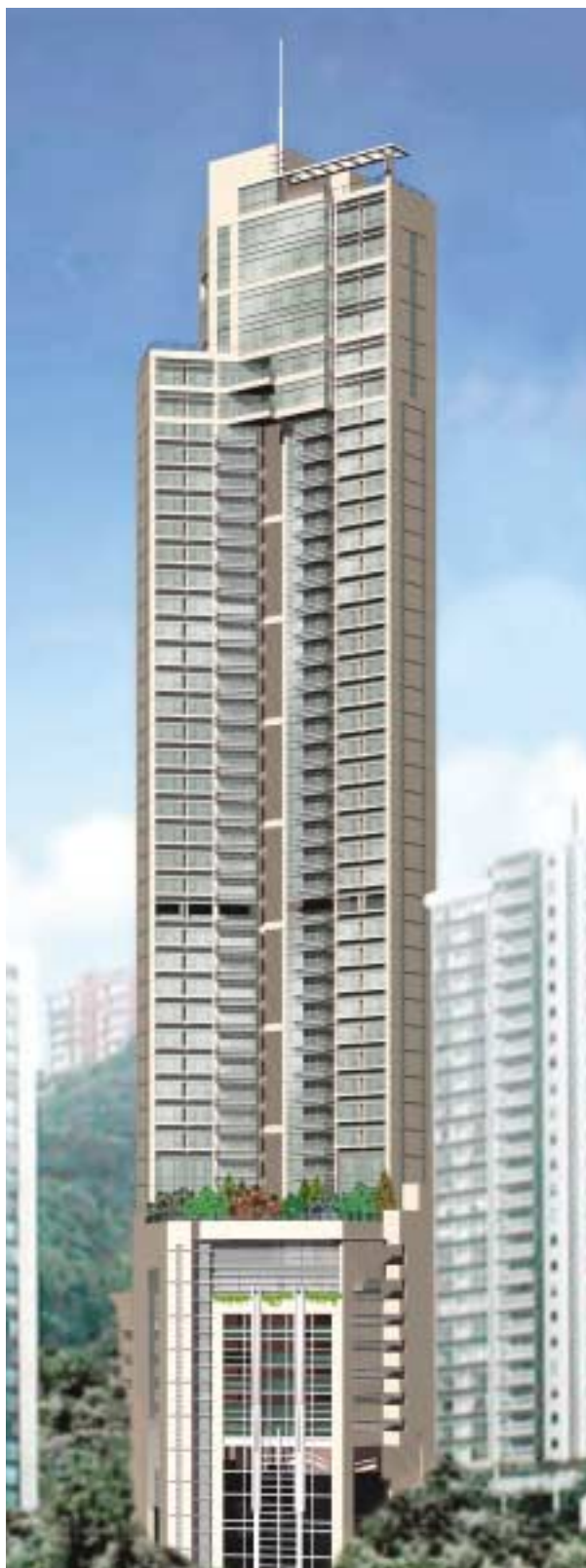
Proposed Ava Mansion development, Tregunter Path, Mid-Levels