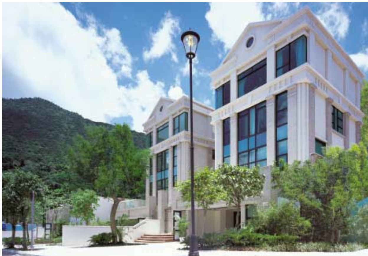
Detached houses at Constellation Cove, Tai Po